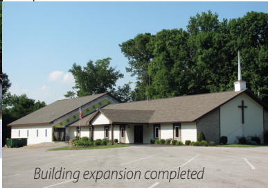
Building expansion completed