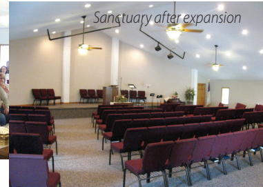
Sanctuary after expansion

a building project. Over three years people of the church raised almost all of the money for the project, but still needed a boost to complete the build. In April 2010 at the Baptist Builders Club administrative meeting Fellowship Baptist was approved for a $10,000 grant. Those funds allowed Fellowship Baptist to finish off the project. One year later they have completed a 7,000 square foot addition that includes an auditorium, classroom space, more bathrooms, teen room, and kitchen.