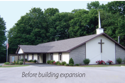
Before building expansion

Attendance at the church had grown so much over the past few years, they could barely fit in the church's 1,200 square foot auditorium. The building had only two restrooms and no real kitchen. In 2006 the church began to plan next steps for