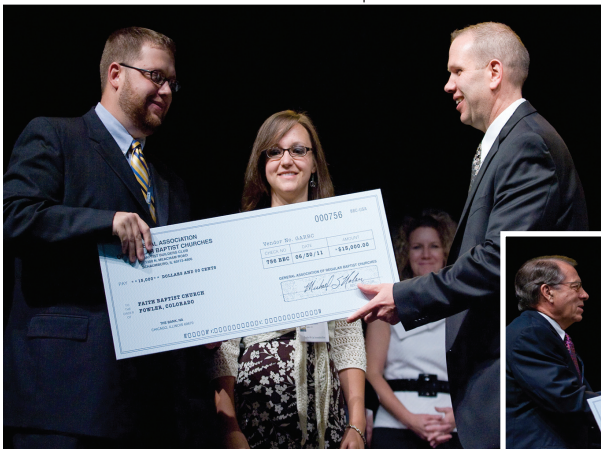
■ Faith Baptist Church, Fowler, Colo.—$15,000

Between November 2010 and April 2011, seven churches received grants from Baptist Builders Club. Five of these churches were represented at the 2011 GARBC Conference and participated in the check presentation. Not present at the conference but also recipients of checks were Calvary Baptist Church, Bay Shore, N.Y.—$5,000, and Oak Grove Baptist Church, Kansas City, Kan.—$5,000.