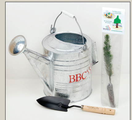
■ Garden trowels and seedlings were given to those who visited the booth.