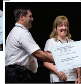
■ Crossroads Baptist Church, Tracy, Calif.—$15,000