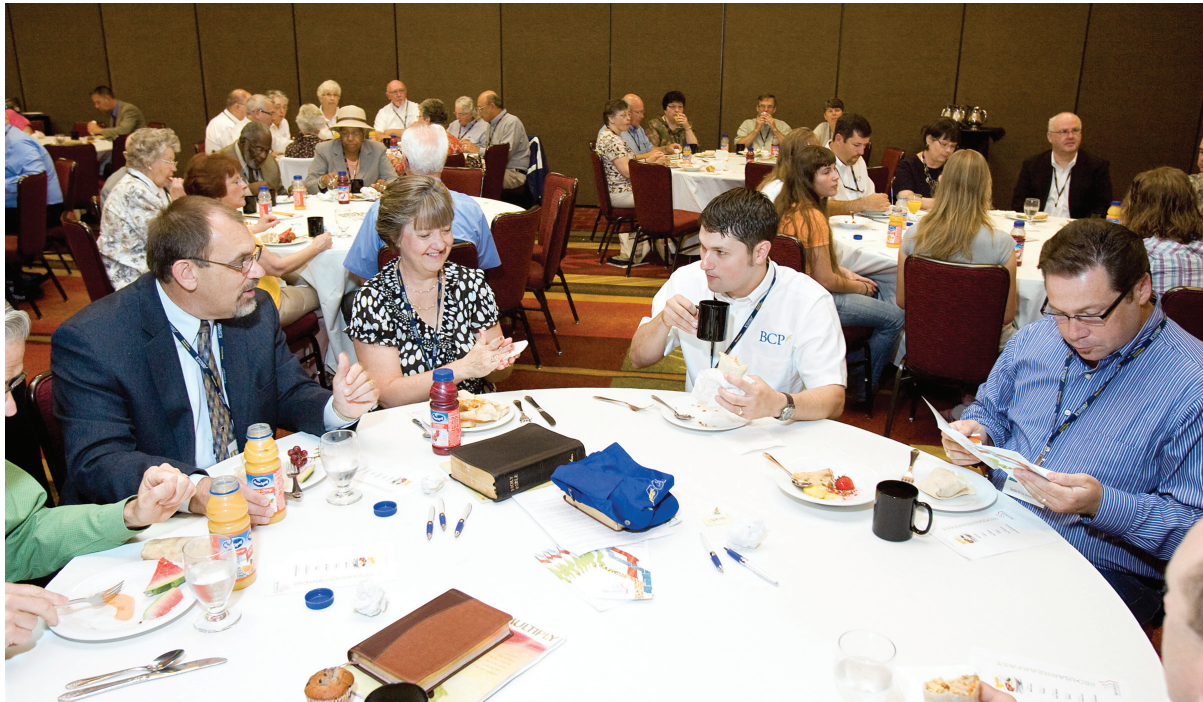
■ Conference attendees enjoy breakfast and fellowshiping.