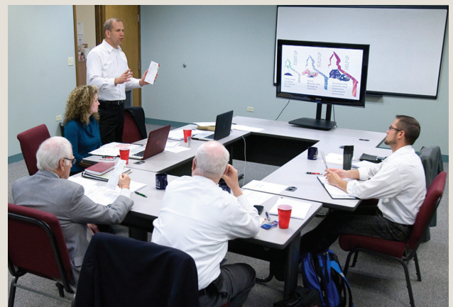
■ BBC board of administrators meeting in November, 2012

Please remember the men in your prayers as they review the applications and discuss business of the ministry.