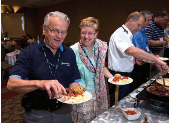
■ Breakfast attendees enjoy fellowshiping as they move through the buffet line.